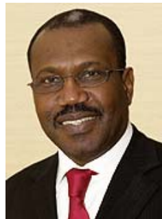
Dr. Hamadoun TOURÉ ITU Secretary-General

In today's world we need to have a high level of expectation that things will work the way we expect them to work.